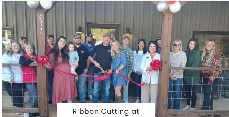
Ribbon Cutting at Alpha Dawg Plumbing

In-Person Members Visits Through Ambassador Ambushes 183