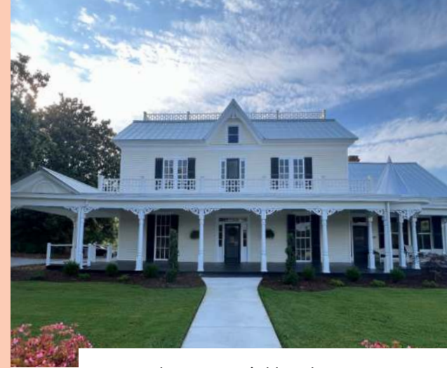
The R.G. Strickland House Home of The Madison County Chamber of Commerce

"I am thrilled to see the opening of our new office in the beautifully restored Greene Family historic home. The office stands as a monument that symbolizes a bright future filled with opportunities for smart growth, collaboration and community pride."